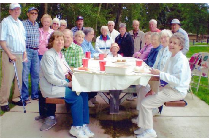
Good Timers enjoyed a picnic in September.