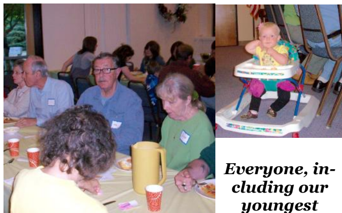
Everyone, including our youngest ones, enjoyed the All Church Gathering in September.

The Advent candle and the beginning pieces for the north wall nativity will be in the sanctuary on Sunday, November 27 , as that is the first Sunday of Advent. But the remainder of the decorations will be added November 30.